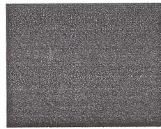
Half-page horizontal 5 x 3.9375 $30