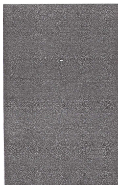
Full-page 5x8 $50

Ads are available in four general sizes, full-page, half-page, quarter-page and eighth-page.