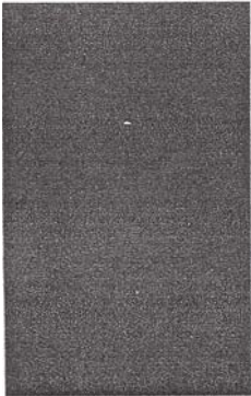
Full-page 5x8 $50

Ad Sizes: Ads are available in two general sizes, full-page and half-page.